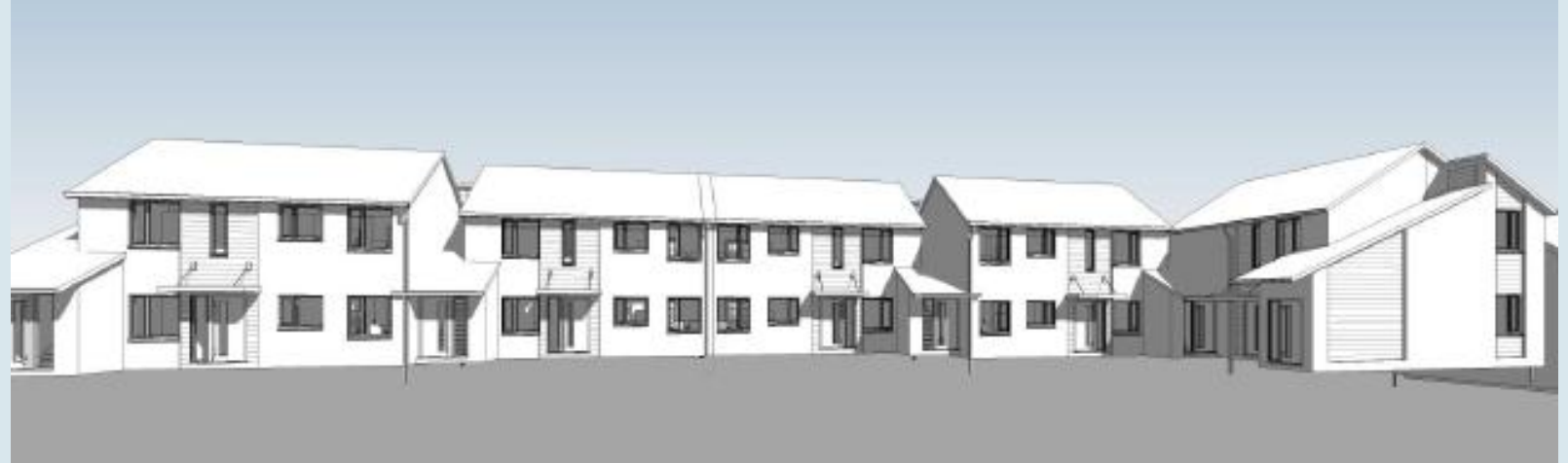
Application Number: 14/00563/FUL