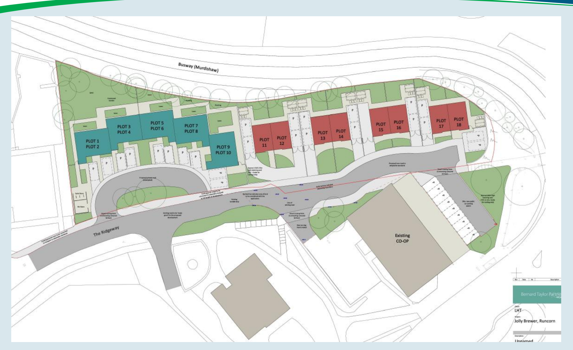
Application Number: 14/00563/FUL