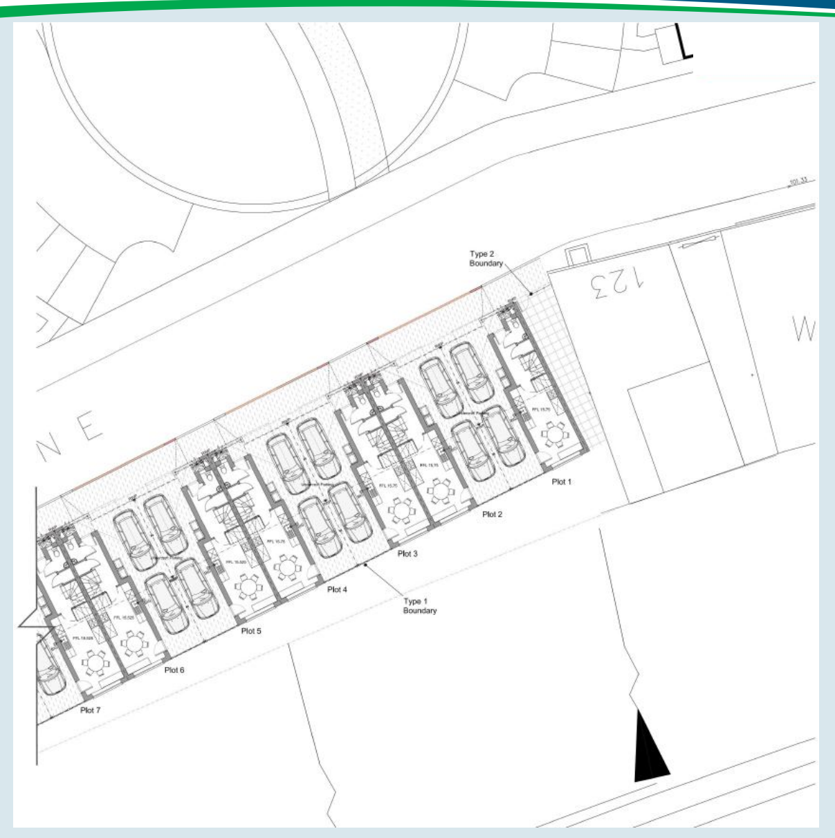
Application Number: 14/00543/FUL