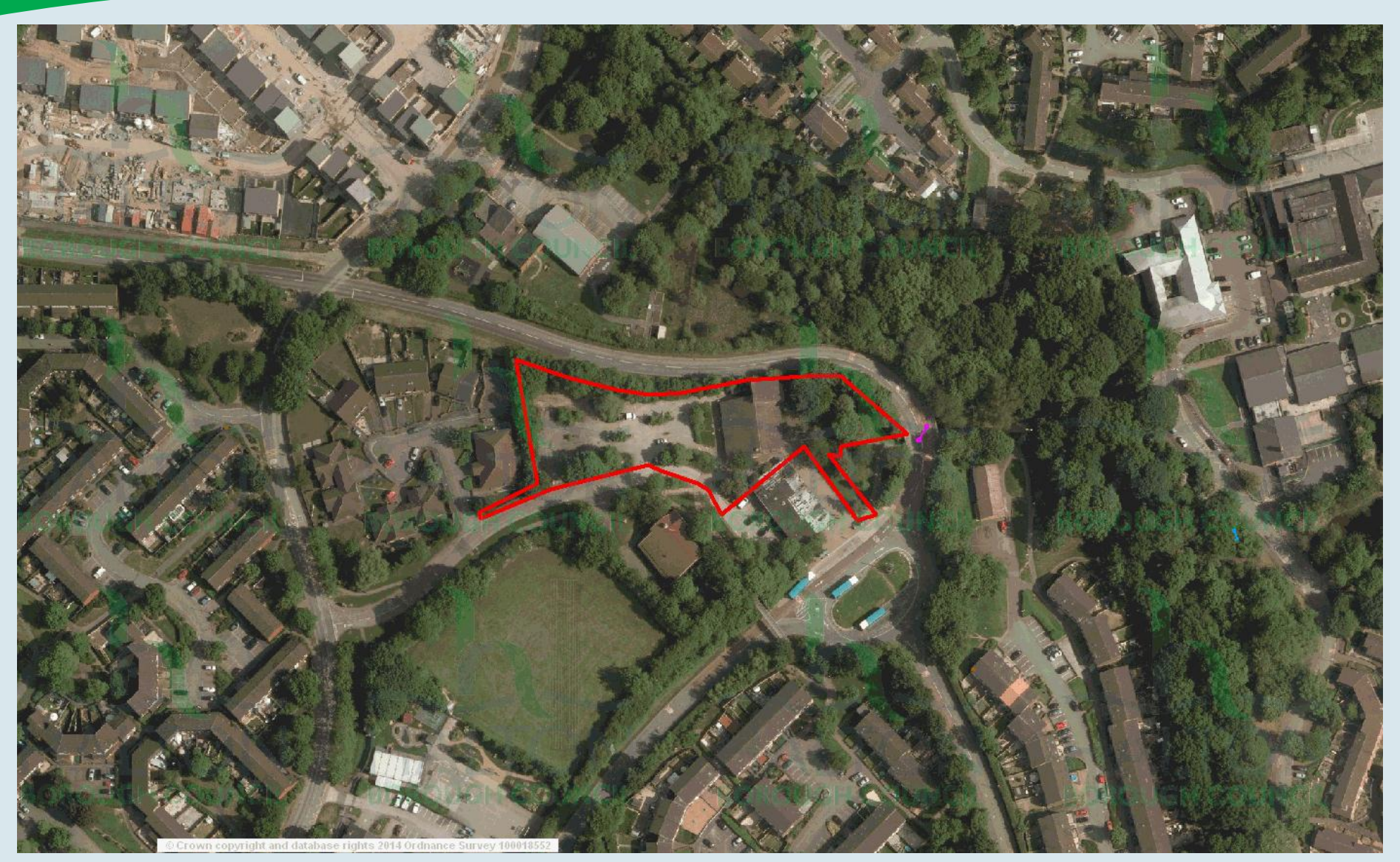
Application Number: 14/00563/FUL