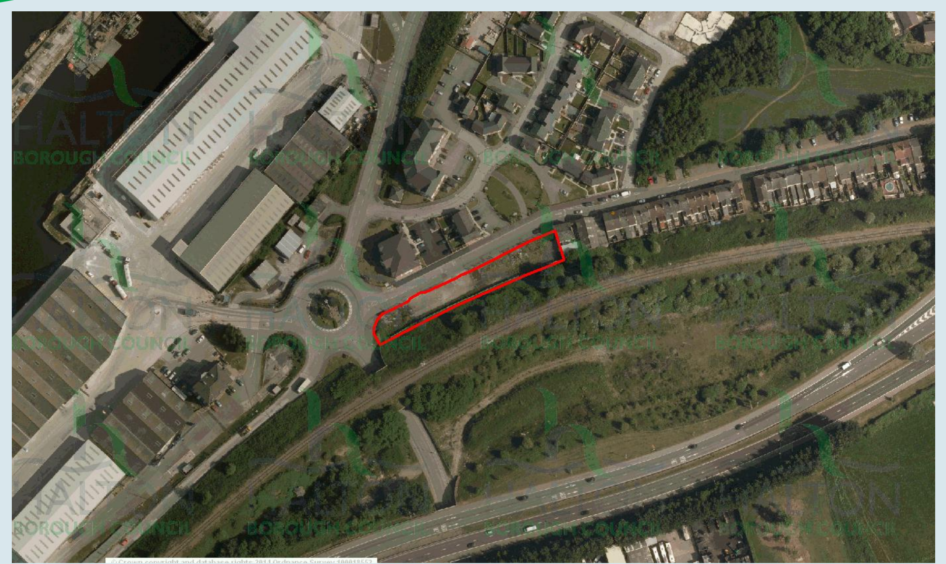
Application Number: 14/00543/FUL