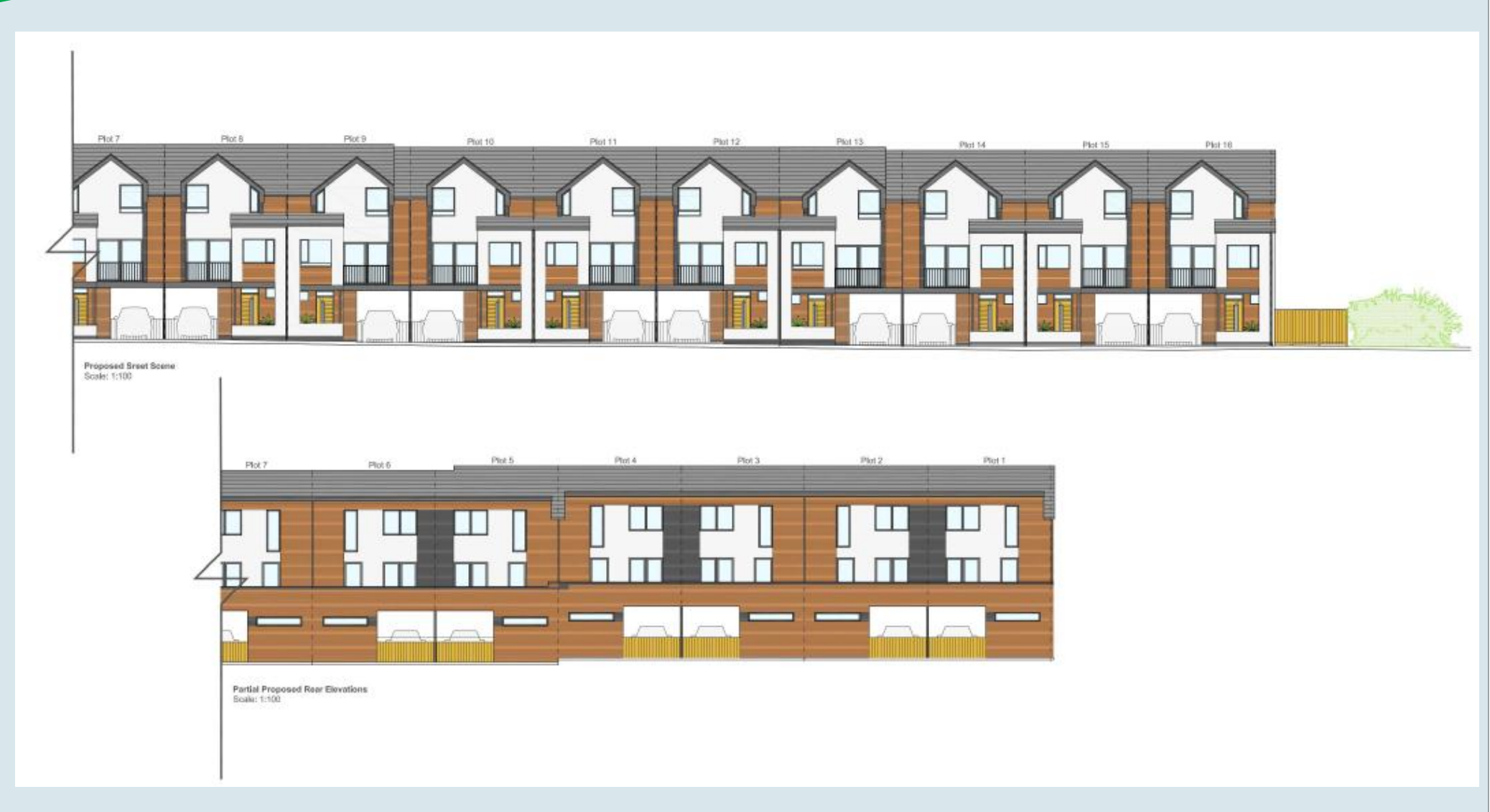
Application Number: 14/00543/FUL