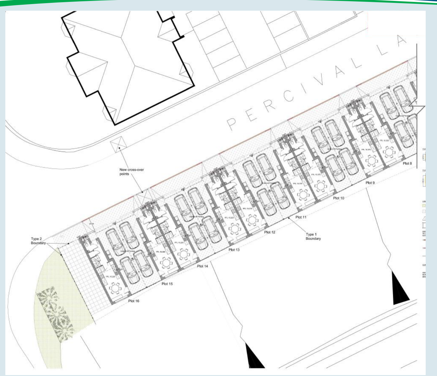
Application Number: 14/00543/FUL